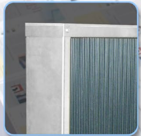
Humidifier air – free from aerosols

The Condair HP supplies demineralized water 70 bars of pressure to atomizer nozzles installed inside of an air duct. Advanced atomizing nozzles generate an extremely fine mist which is rapidly absorbed into the airstream while a highly efficient droplet separator contains any excess water within section. Cool, humidifier air is then released into rooms, creating a healthy environment and enhancing productivity.