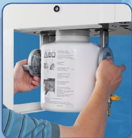
External scale collection tank