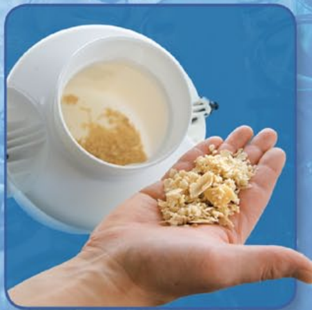
Patented scale management