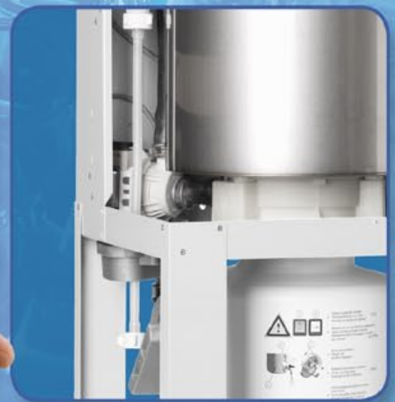
Scale-free cylinder purging water

Thanks to the external scale collection tank, the length of maintenance intervals is extended considerably and necessary maintenance tasks reduced to a minimum. Excellent access is ensured by the external arrangement of the scale collection tank under the unit. It can be removed from this position and emptied without opening the unit housing. Maintenance measures can be realised much easier and considerably quicker as a result.